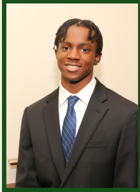
Sheppard Southall Baltimore Polytechnic Institute Office of the Public Defender