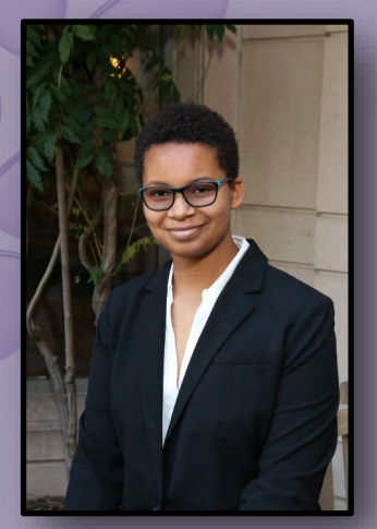
Zora Cabell Mergenthaler Vocational Technical Semmes, Bowen & Semmes

"Be somebody nobody thought you could be."